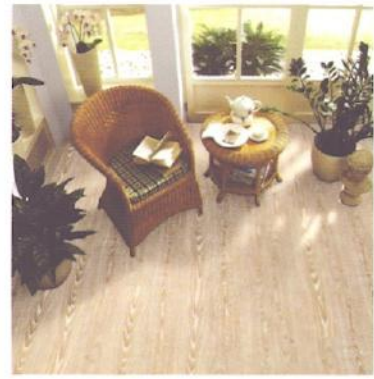
HDF Laminated Flooring