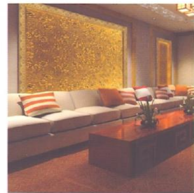
Embossed HDF Board