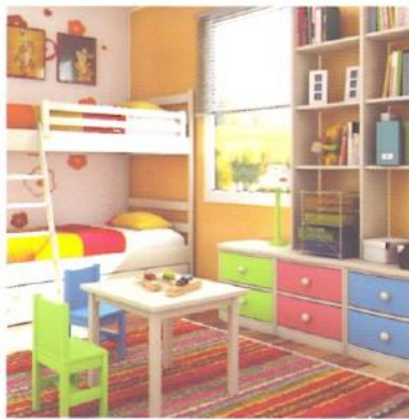
Pre-Laminated MDF & HDF Board