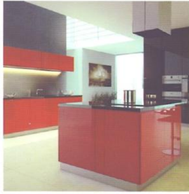
UV Coated Board